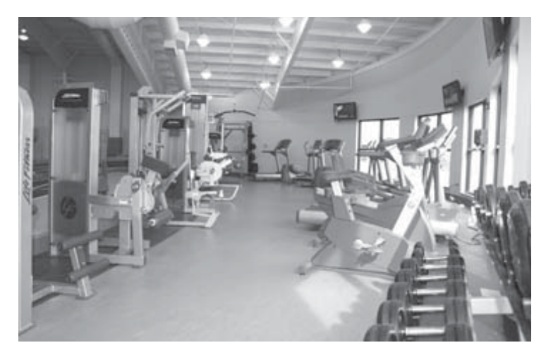
Wellness Center Fitness Area

Conference this summer in the state of Washington. Eleven of our faculty and staff will be going to Evergreen University to develop a plan to utilize the latest in teaching through Learning Communities.