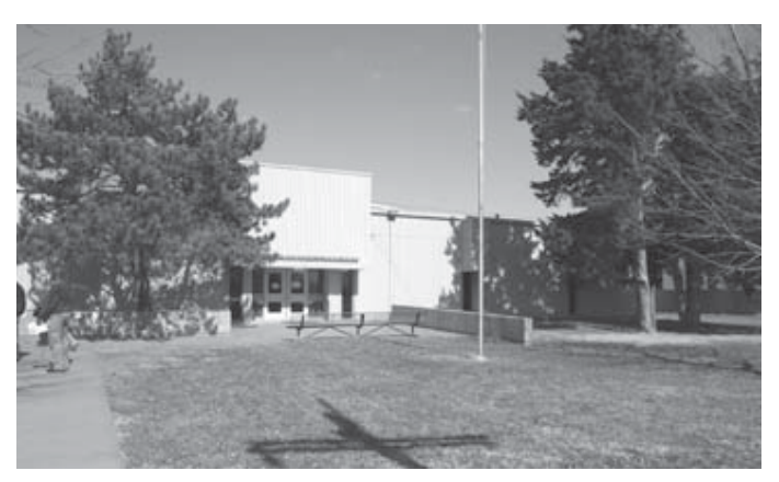
HCC at Perry Facility

The HCC Foundation is in the final stages of negotiating the purchase of the middle school building at Perry. The Perry Lecompton school district is building a new middle school, and we were able to partner with them for the purchase of their "old" facility. The Foundation anticipates taking ownership of that building on July 1, which will allow us to greatly enhance our course offerings – we'll now be able to offer day classes as well as those in the evening – to the people in that region, including students at KU. The purchase of this facility is the focus of the Foundation's Annual Fund, which always needs your support. We are certainly looking forward to that facility being open in the fall.