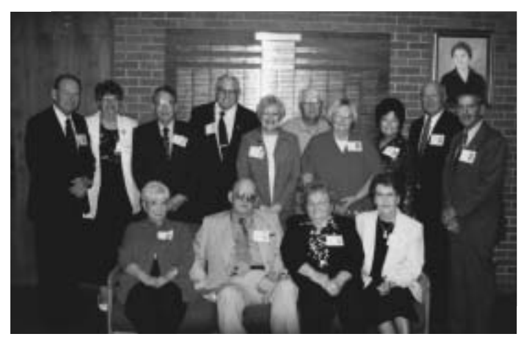
Returning Class of 1954

Many member of the class of 1954 and their guests enjoyed an afternoon campus tour. Stories about climbing out windows and cutting a particular class were among those told. What an enjoyable and entertaining group they are!