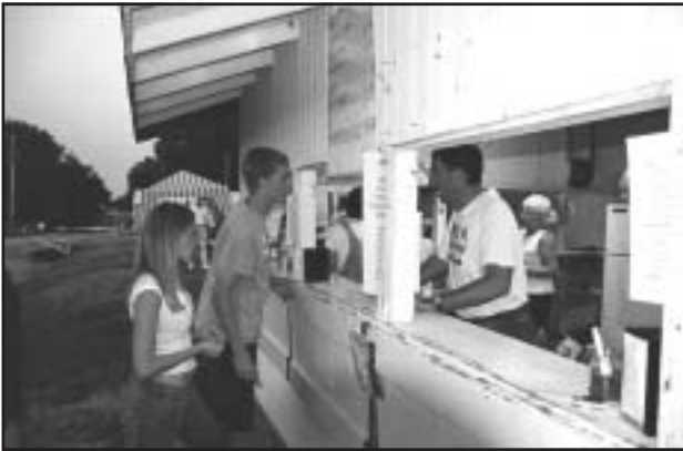
Alumni Games 2003

This issue of the HCC Connection is complimentary for all alumni on our current mailing list. If you would like to continue to receive this newsletter throughout the year, you must be a dues-paying member. Please help support this newsletter by sending your payment with the above form to the HCC Alumni Office.